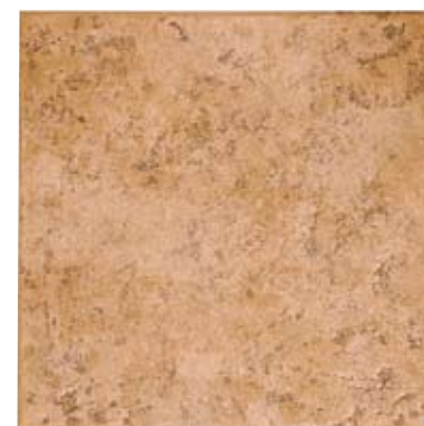
HRN 11 30x30 12"x12" 053