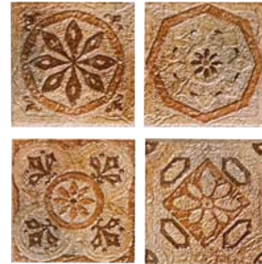
Carpegna A 15x15 6"x6" 017 4 Soggetti assortiti 4 Different designs 4 Motive sortiert 4 Sujets assortis