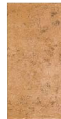
HRN 11 15x30 6"x12" 058