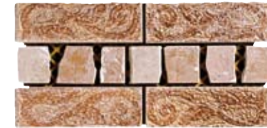
Carpegna Fascia Lineare 15x30 6"x12" 046