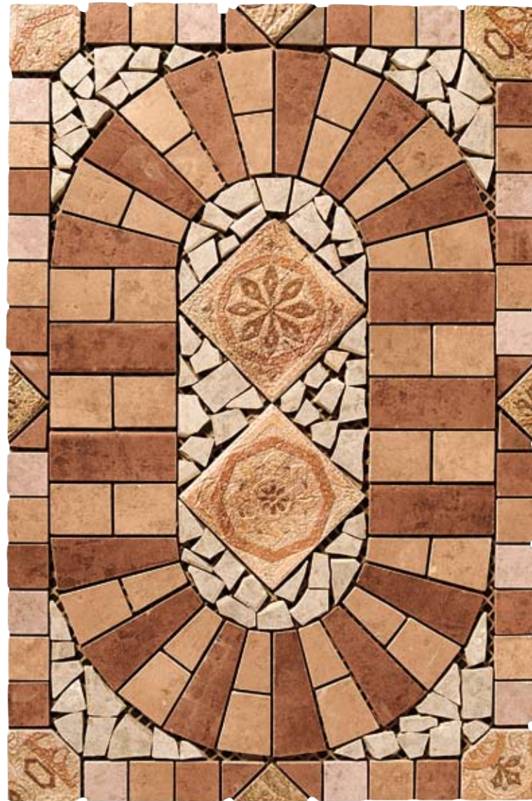
Carpegna Tappeto 60x90 24"x36" 432