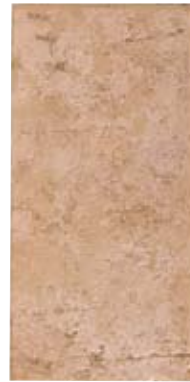
HRN 4 15x30 6"x12" 058