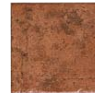
HRN 6 15x15 6"x6" 058