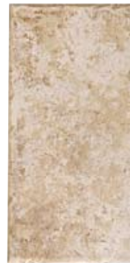
HRN 5 15x30 6"x12" 058