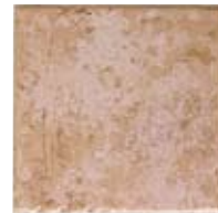
HRN 4 15x15 6"x6" 058