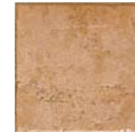
HRN 11 15x15 6"x6" 058