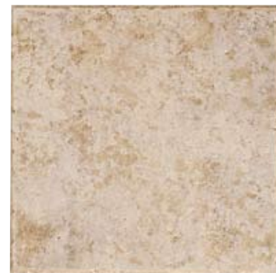
HRN 5 30x30 12"x12" 053