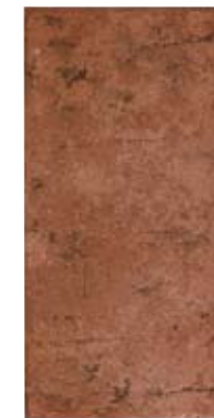
HRN 6 15x30 6"x12" 058