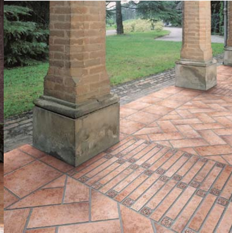
HRN 4 Carpegna A