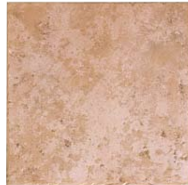
HRN 4 30x30 12"x12" 053