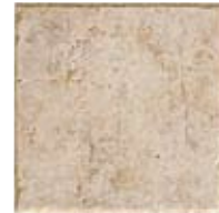
HRN 5 15x15 6"x6" 058