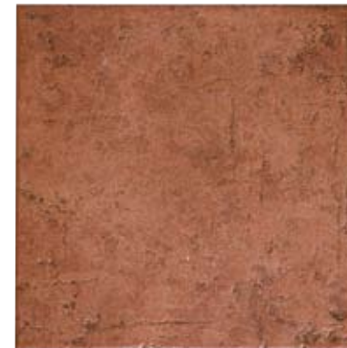
HRN 6 30x30 12"x12" 053